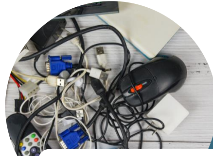
ELECTRICAL & ELECTRONICAL WASTE