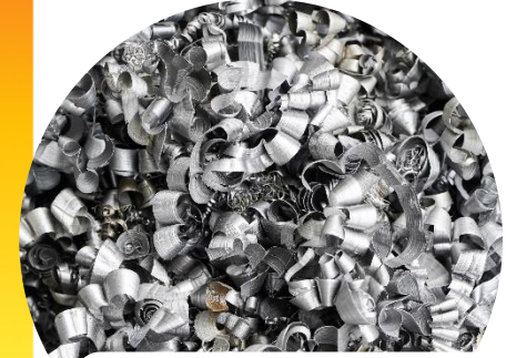
Ferrous and non-ferrous METALS