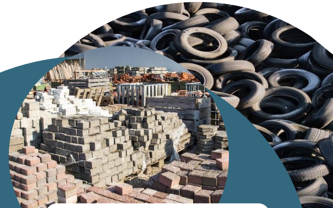
CONSTRUCTION & DEMOLITION WASTE