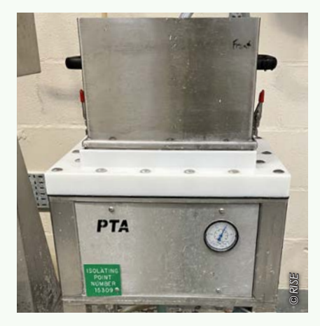
The Sommerville Fractionator houses the coarse or fine screen to facilitate separation of fibres from rejects. The fibres are made into hand sheets to assess the properties of the paper.

To translate the output values into a single "recyclability score", the sum of the scores obtained for yield, visual impurities and sheet adhesiveness are considered. Fibre-based packaging needs to attain a score of between 0 and 100 to be considered "suitable for standard mill recycling". Guidance is provided to assess the impact of each output value on either process efficiency or recycled paper quality and serve to inform the eco-design process. The approach provides recyclability data which gives standard recycling mills confidence that valuable fibres can be recovered from fibre-based packaging which has passed the test.